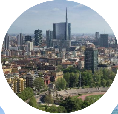
Città Metropolitana de Milano (CMM)