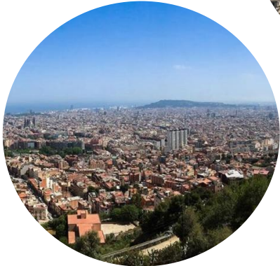
Àrea Metropolitana de Barcelona (AMB)