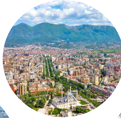
Municipality of Tirana